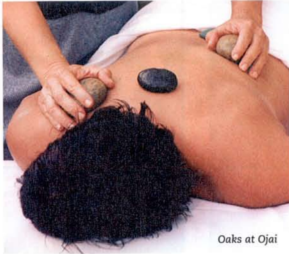
Oaks at Ojai